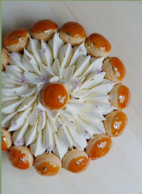
7" St. Honore